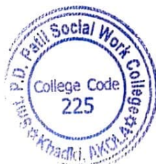
Principal, Smt. Panchfuladevi Patil College of Social Work, Khadki, Akola (M.S.)